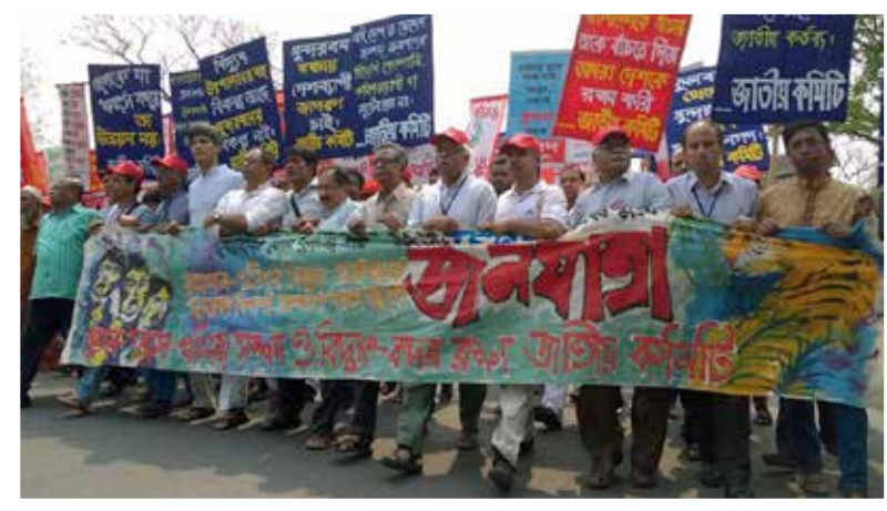
Protest in Bangladesh against NTPC coal plant Rampal

companies to improve their climate risk reporting. These are all laudable steps, but climate risk reports are no guarantee for effective actions to reduce emissions. And green bonds do not undo the damage of investing billions of dollars in companies whose business plans are a blueprint for overshooting the Paris