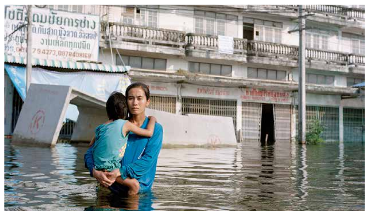
Flooding in Thailand